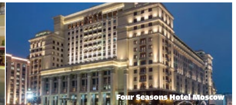
Four Seasons Hotel Moscow