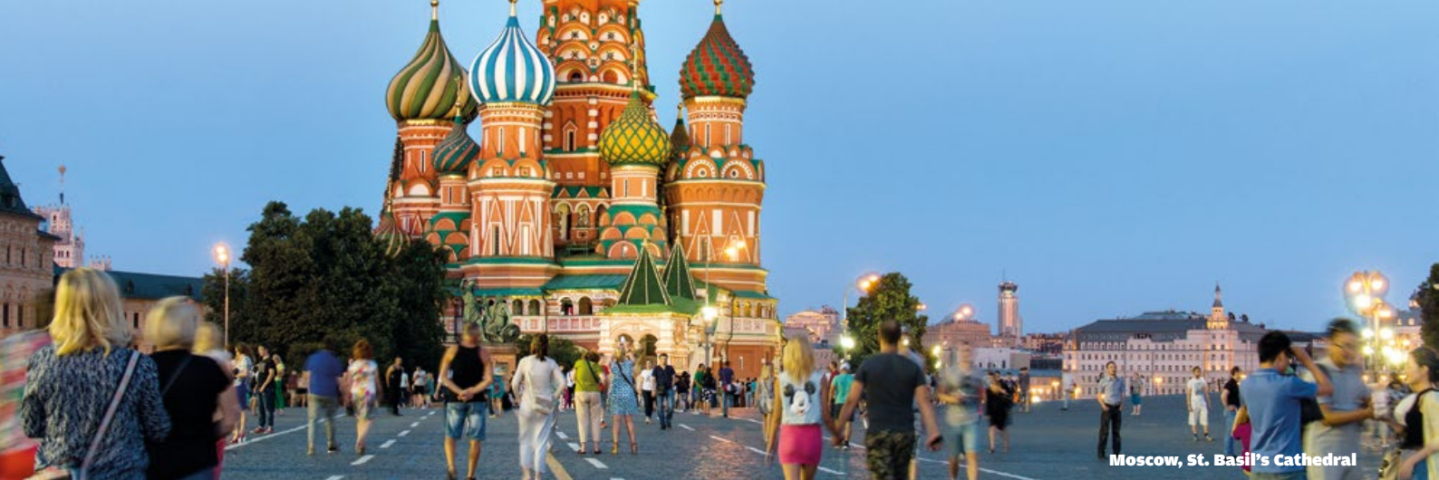
Moscow, St. Basil's Cathedral