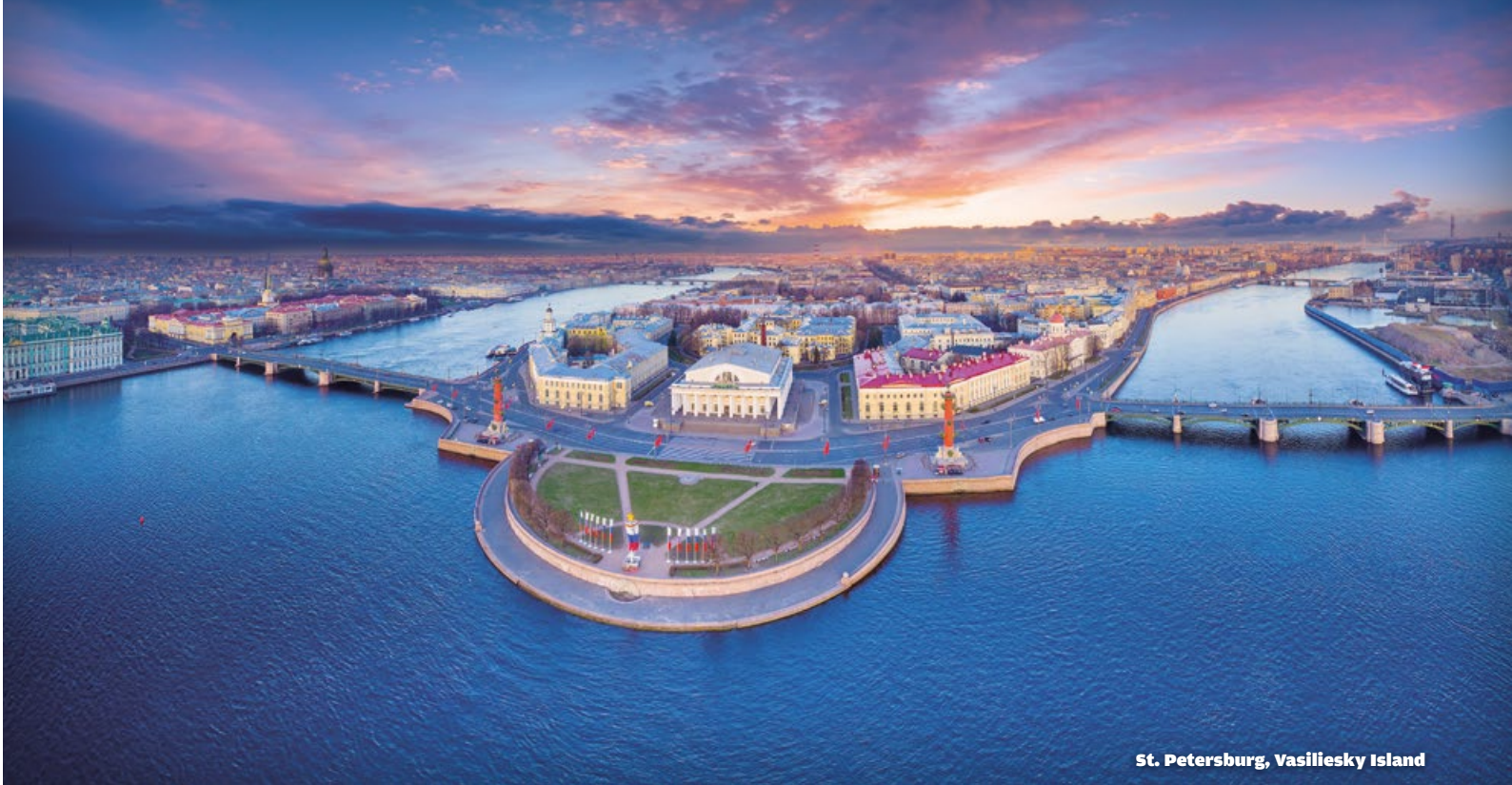
St. Petersburg, Vasilievsky Island