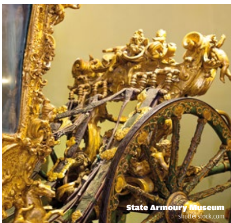
State Armoury Museum

All sightseeing is conducted in small groups with professional English speaking local guides. Excursions on the Gold program will be conducted in groups of maximum 25 guests; Platinum program groups will comprise a maximum of 16 guests and Imperial a maximum of 10 guests. Your Cruise Tour includes daily sightseeing excursions - including these must-see highlights.