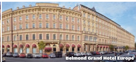
Belmond Grand Hotel Europe

Situated in the heart of the city, on the Moika River, in the aristocratic mansion built in 1853, Kempinski Hotel Moika 22 overlooks Palace Square and the Hermitage Museum. The hotel is just five minutes' walk from Nevsky Prospekt and close to all major sights and shopping. The rooms are decorated in classic marine style. The popular Bellevue Brasserie restaurant offers 360-degree views of the city.