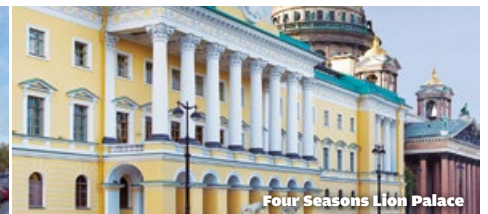
Four Seasons Lion Palace