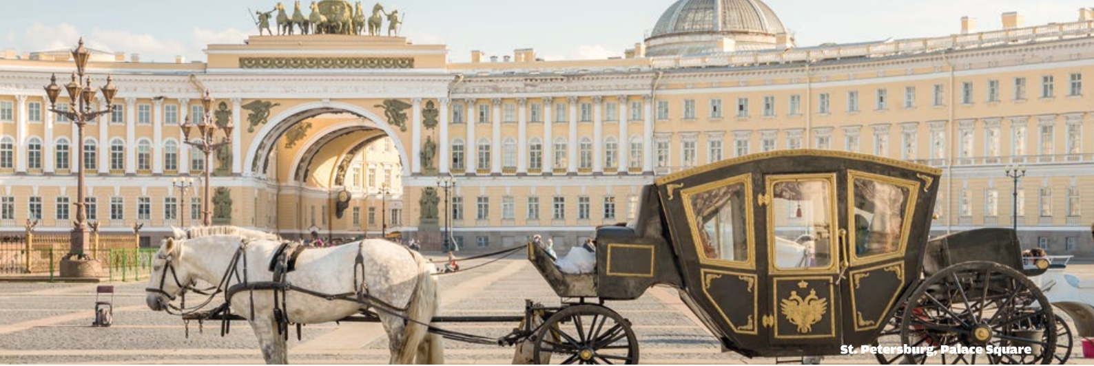
St. Petersburg, Palace Square