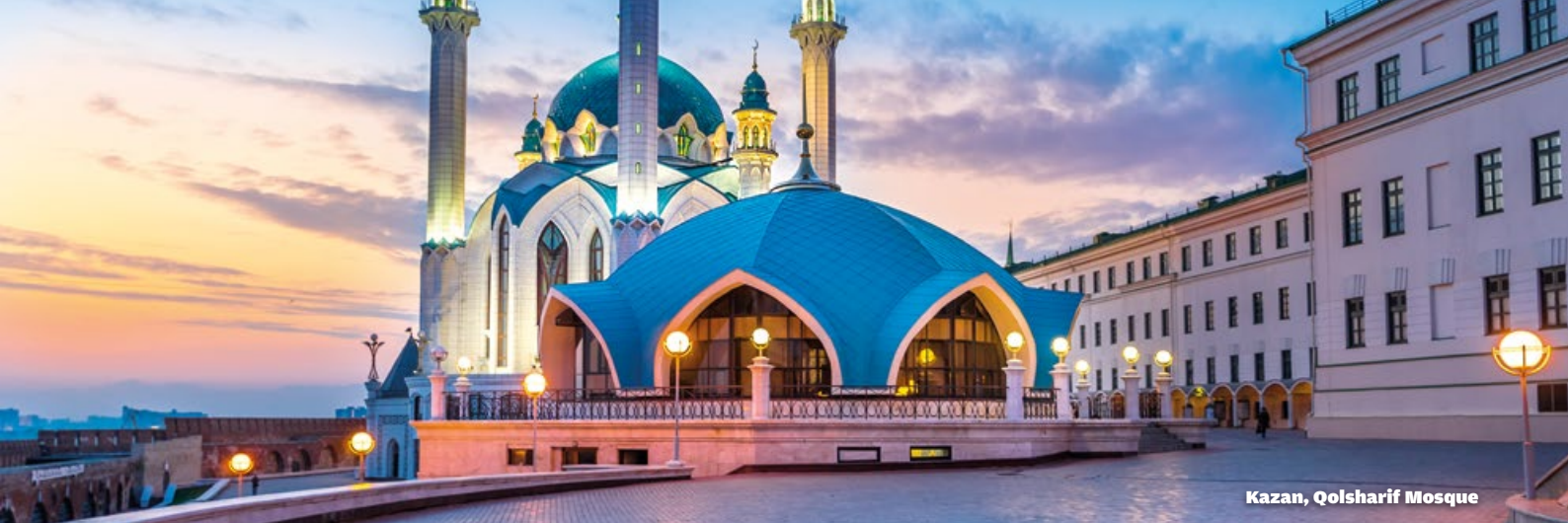
Kazan, Qolsharif Mosque