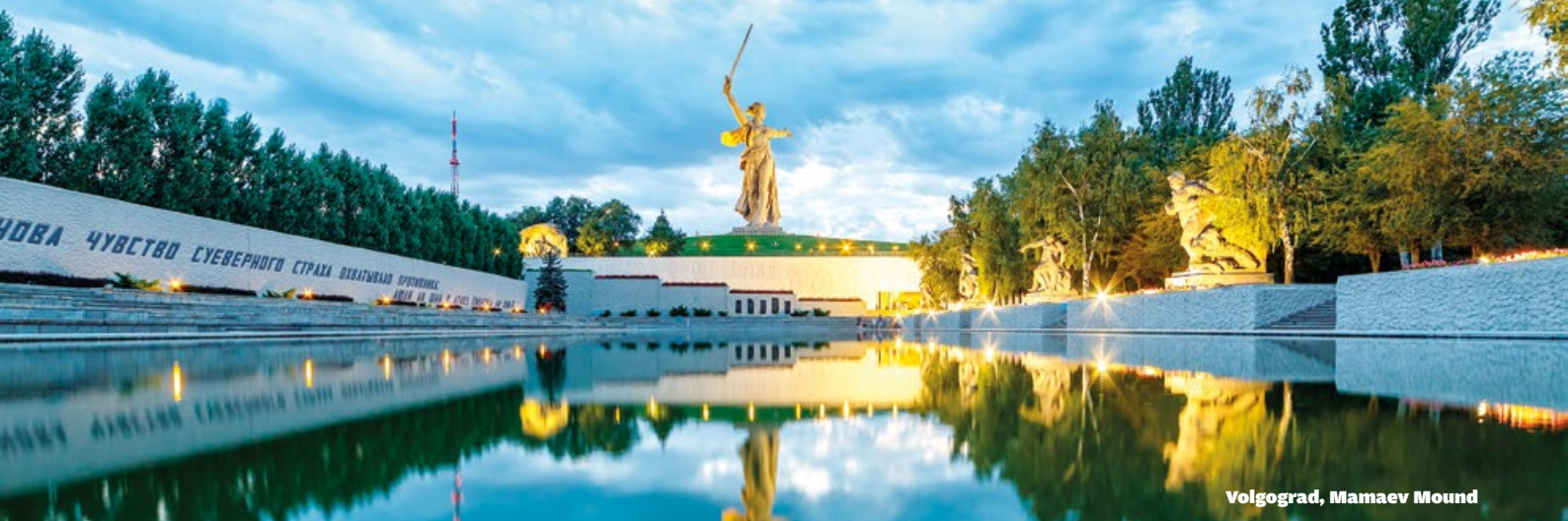
Volgograd, Mamaev Mound