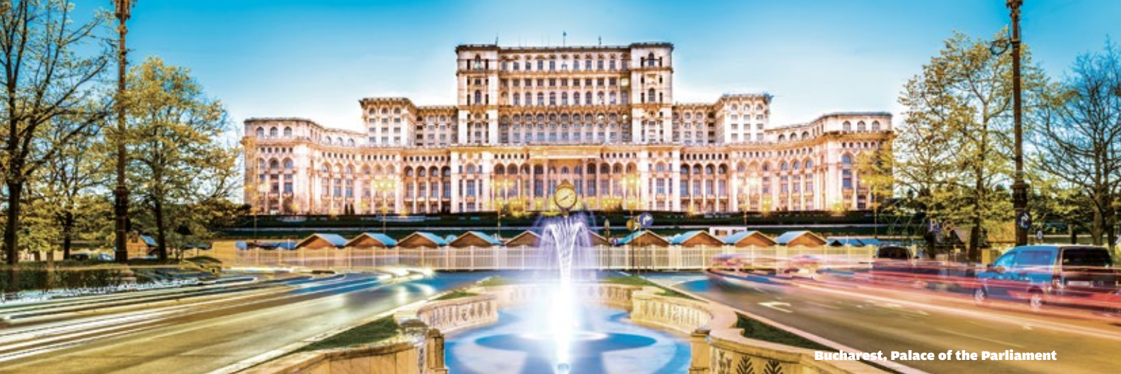
Bucharest, Palace of the Parliament