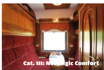
Cat. III: Nostalgic Comfort