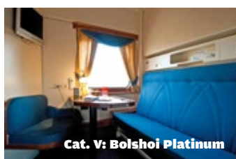
Cat. V: Bolshoi Platinum