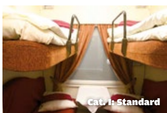
Cat. I: Standard

Bolshoi Platinum compartments are 7.15m 2 with an upper (0.82 by 1.74 metres) and lower (1.2 by 1.84 metres) berth. There is also a small sofa, table and spacious wardrobe. The ensuite bathroom has wash basin, WC and full shower. Each carriage has 5 compartments.