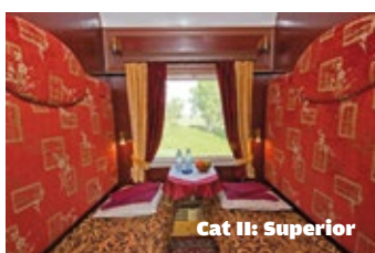
Cat. II: Superior