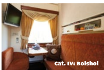
Cat. IV: Bolshoi