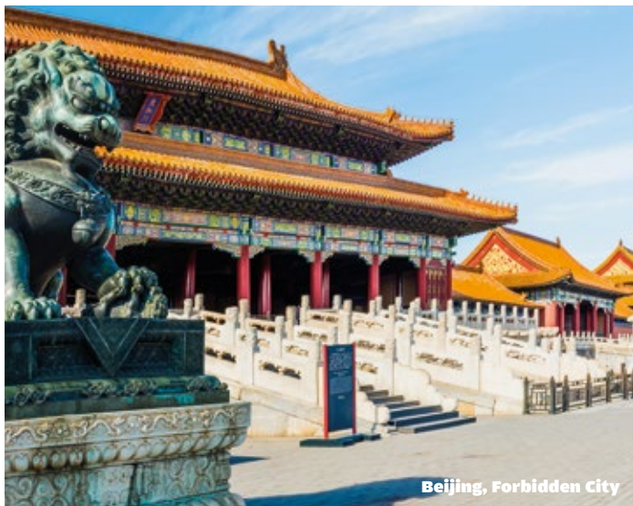
Beijing, Forbidden City