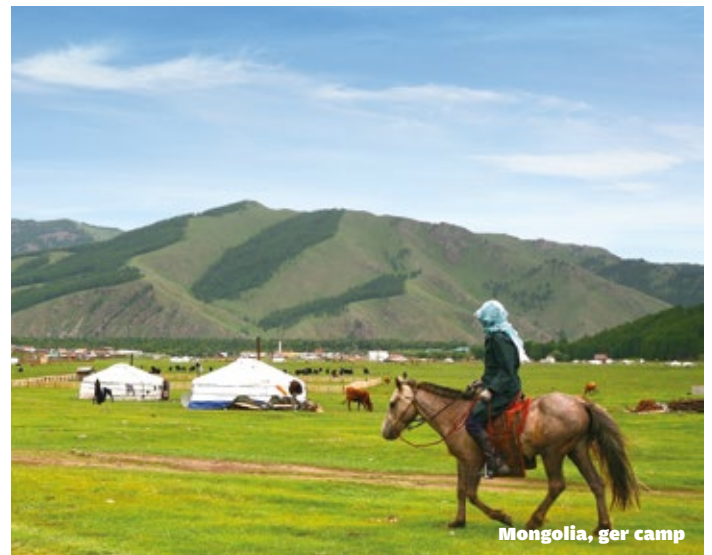
Mongolia, ger camp