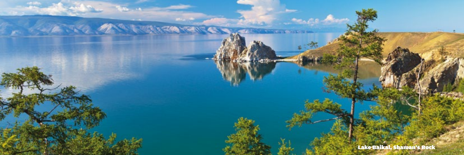
Lake Baikal, Shaman's Rock