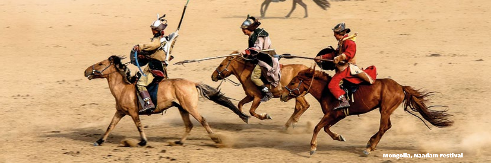
Mongolia, Naadam Festival