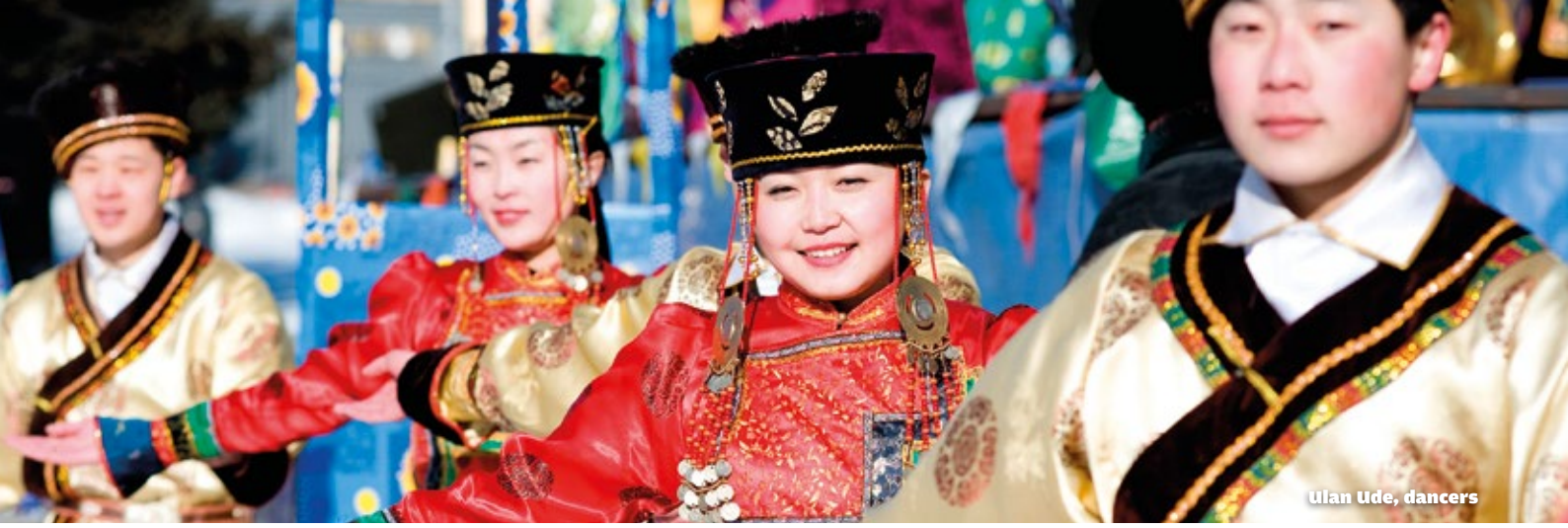
Ulan Ude, dancers