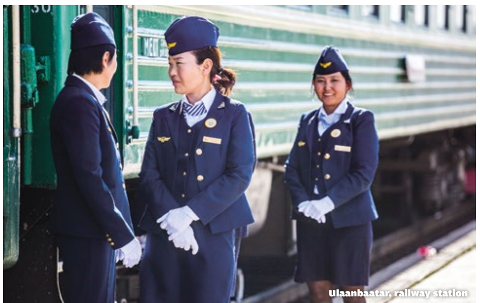
Ulaanbaatar, railway station