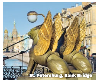
St. Petersburg, Bank Bridge