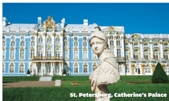
St. Petersburg, Catherine's Palace