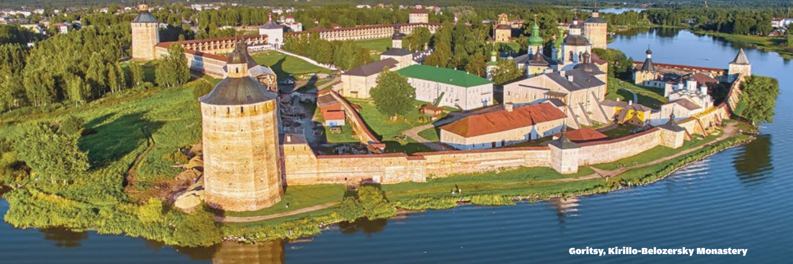
Goritsy, Kirillo-Belozersky Monastery