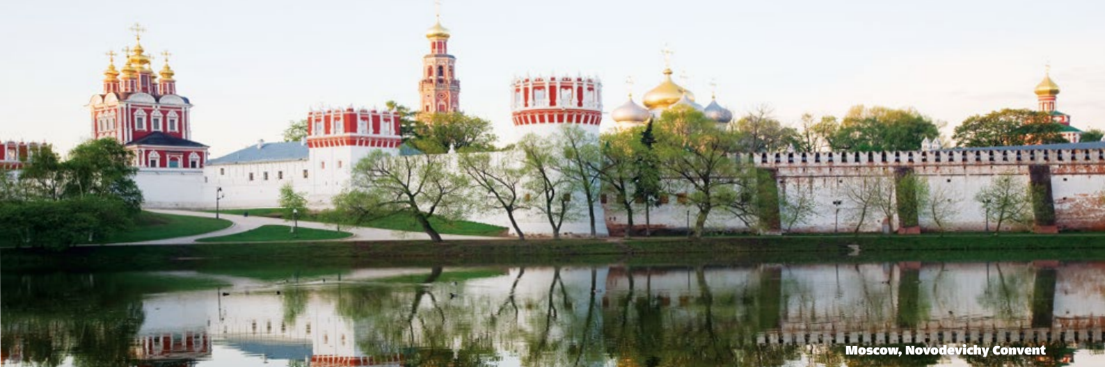
Moscow, Novodevichy Convent