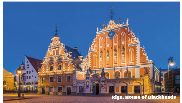
Riga, House of Blackheads