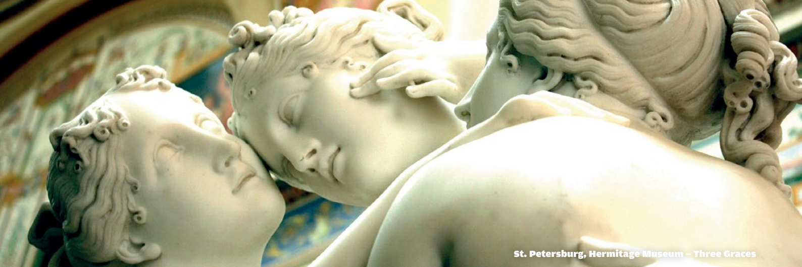
St. Petersburg, Hermitage Museum – Three Graces