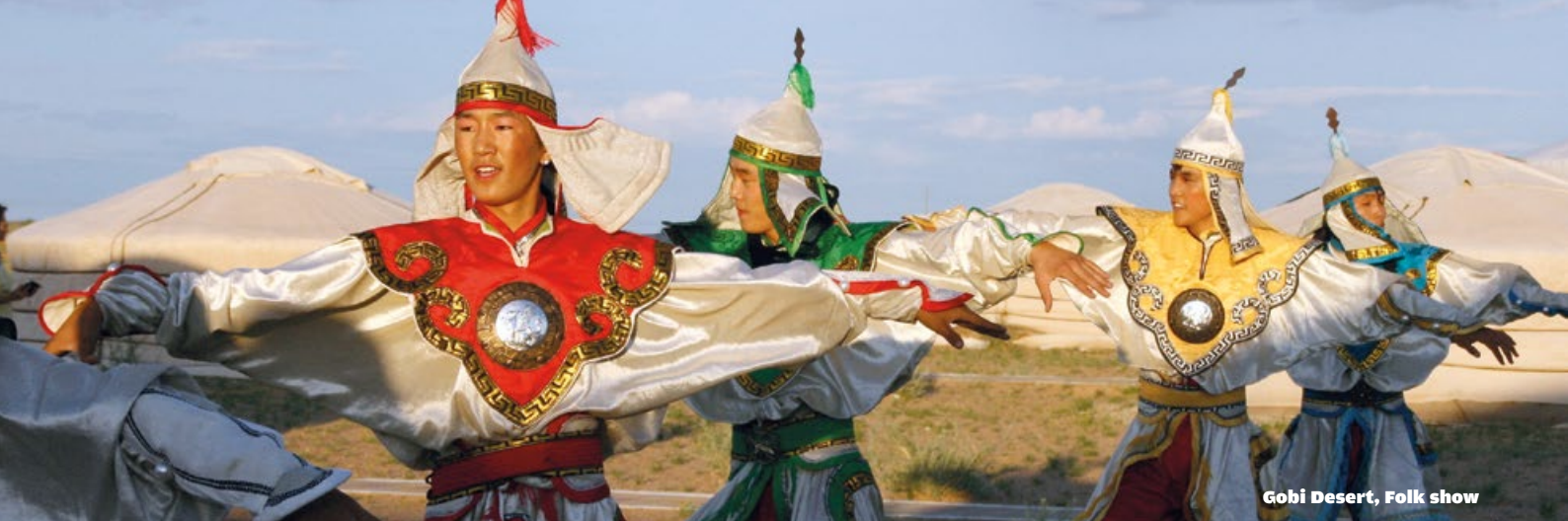
Gobi Desert, Folk show