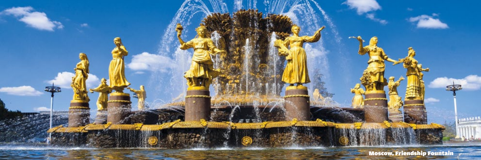
Moscow, Friendship Fountain