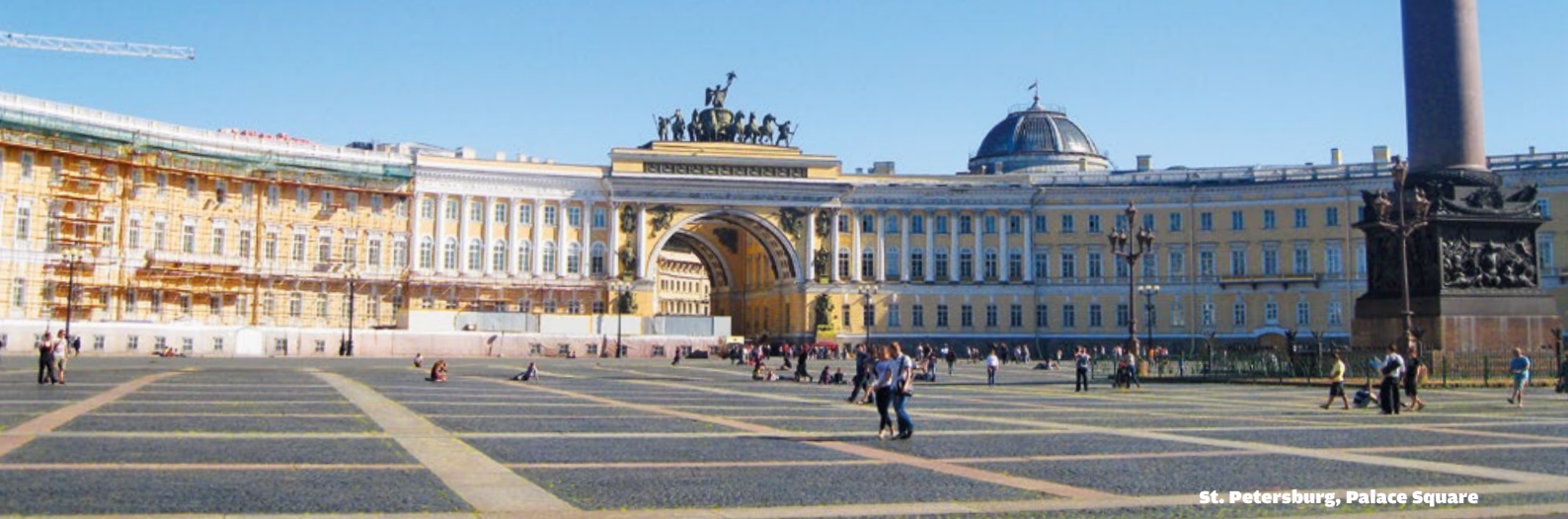
St. Petersburg, Palace Square