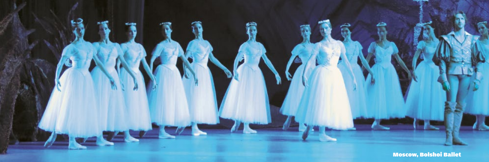
Moscow, Bolshoi Ballet