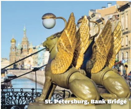
St. Petersburg, Bank Bridge