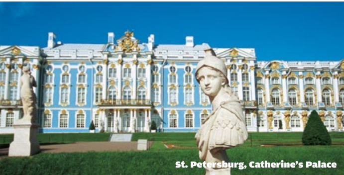
St. Petersburg, Catherine's Palace