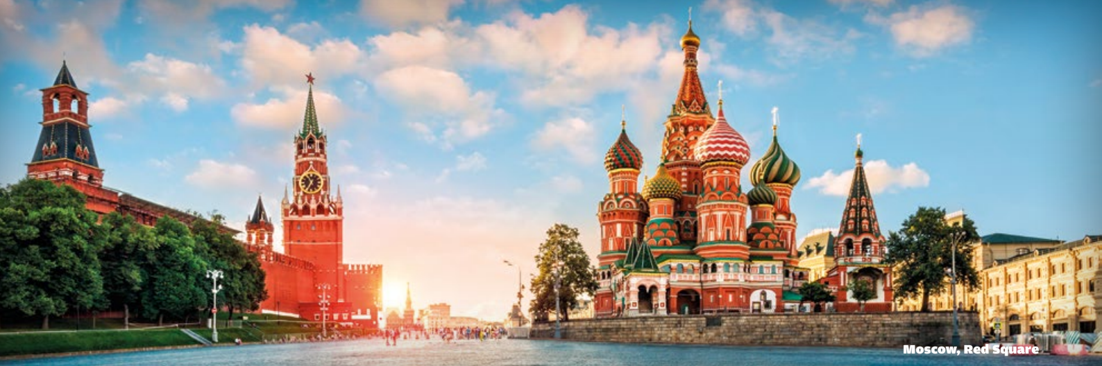
Moscow, Red Square