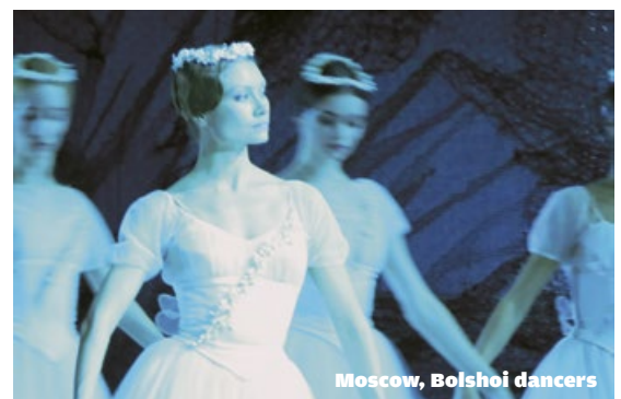
Moscow, Bolshoi dancers