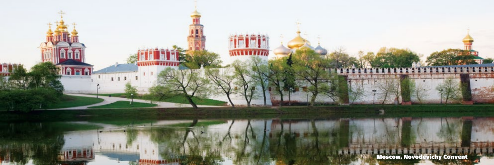
Moscow, Novodevichy Convent