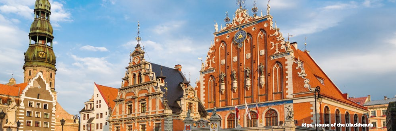
Riga, House of the Blackheads