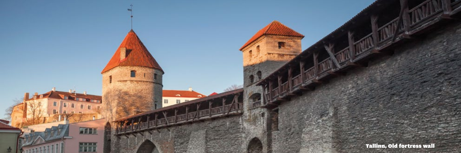
Tallinn, Old fortress wall