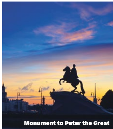
Monument to Peter the Great