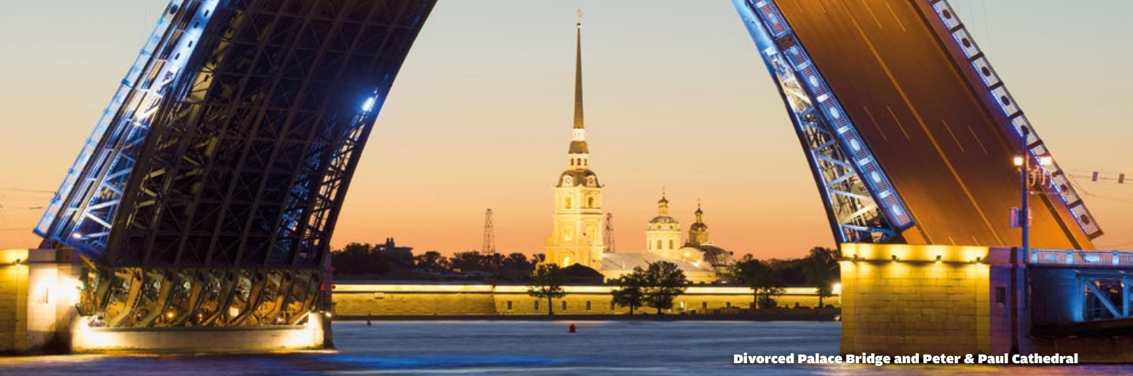
Divorced Palace Bridge and Peter & Paul Cathedral