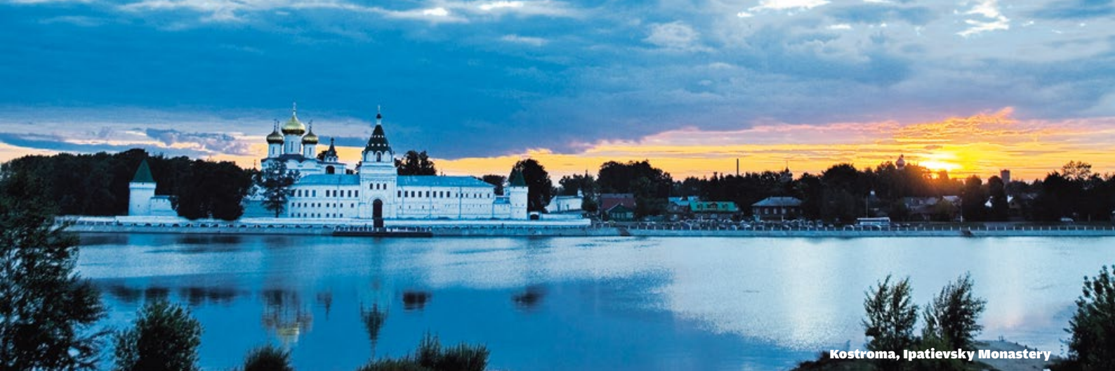
Kostroma, Ipatievsky Monastery