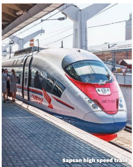
Sapsan high speed train

Rail transportation can only be booked in conjunction with accommodation. Schedules are accurate at the time of printing, but subject to confirmation. Prices include seat reservation. Russian Railways do not always differentiate between sexes when allocating sleeping berths. Passport details required. Reservations are generally confirmed 45-35 days prior to travel and once purchased are non-refundable.