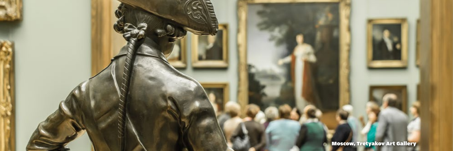
Moscow, Tretyakov Art Gallery