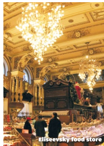
Elisevsky food store