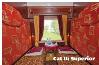
Cat. II: Superior