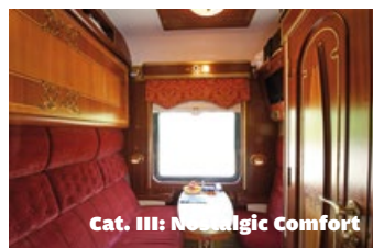
Cat. III: Nostalgic Comfort