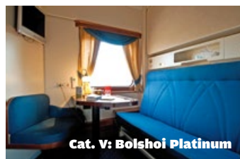
Cat. V: Bolshoi Platinum