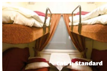
Cat. I: Standard

This exciting rail tour by private train offers a unique combination of train and hotel accommodation, enabling you to regain your 'land legs' and sleep in a full-sized bed at overnight stops along the way. The mix of guests on board consists of various nationalities, and the on board announcements will reflect this. Your sightseeing excursions will be conducted in English, within an English speaking group. As a rule, dining is one sitting with nationalities seated together according to language.