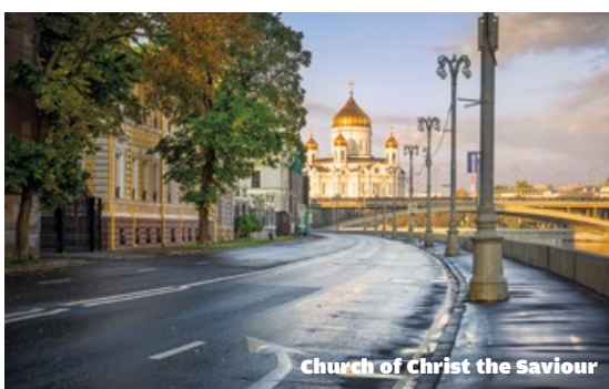
Church of Christ the Saviour

(9) Ritz-Carlton ★★★★★ 3 Tverskaya St. Glamorous hotel on the edge of Red Square. Spacious rooms with A/C, safe, free Wi-Fi, iron/board, tea/coffee in room. Business centre, spa, pool, gym, restaurants, 02 rooftop terrace/lounge with panoramic views of Red Square and the Kremlin. Metro Okhotny Ryad