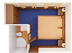
Deluxe Double Stateroom 11.3m 2