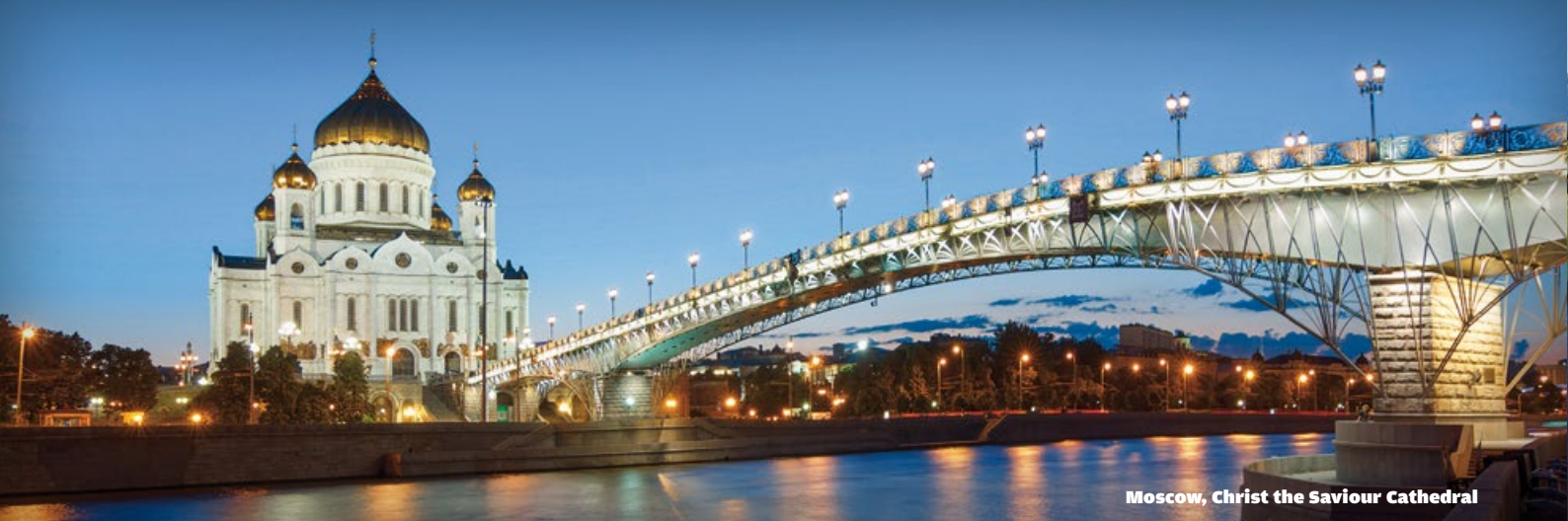
Moscow, Christ the Saviour Cathedral