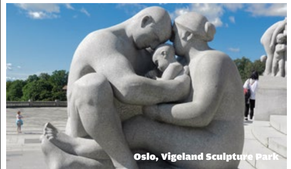
Oslo, Vigeland Sculpture Park