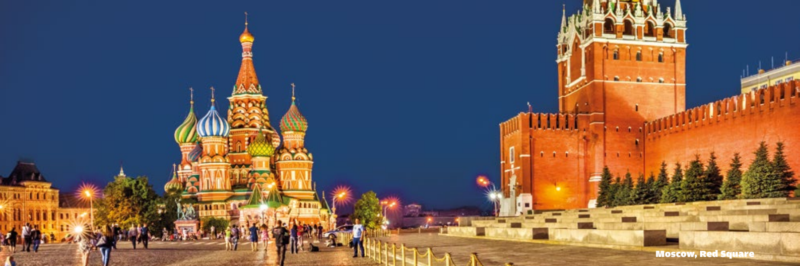
Moscow, Red Square