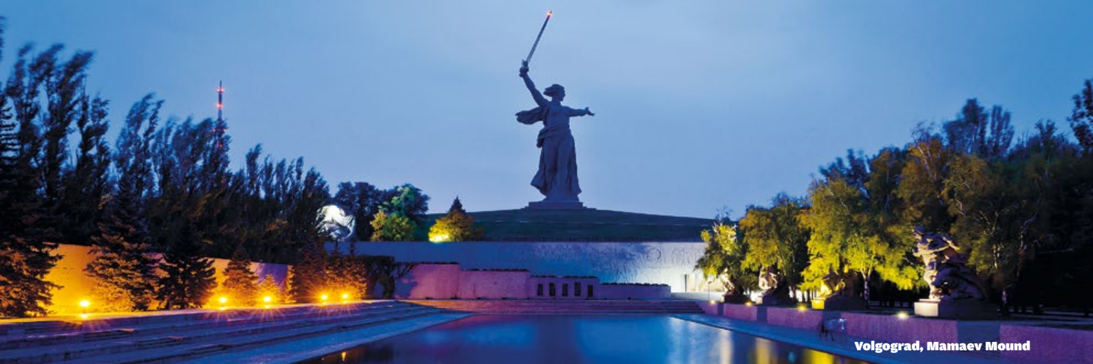
Volgograd, Mamaev Mound