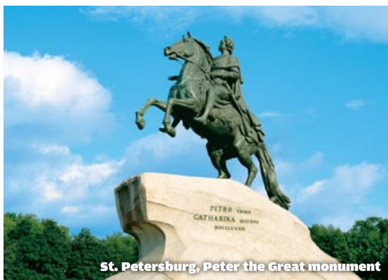
St. Petersburg, Peter the Great monument

■ Limited single cabins are available on Promenade and Sun Deck. For sole use of a twin or deluxe cabin - prices are on application. ■ For deck and cabin plans see page 5.