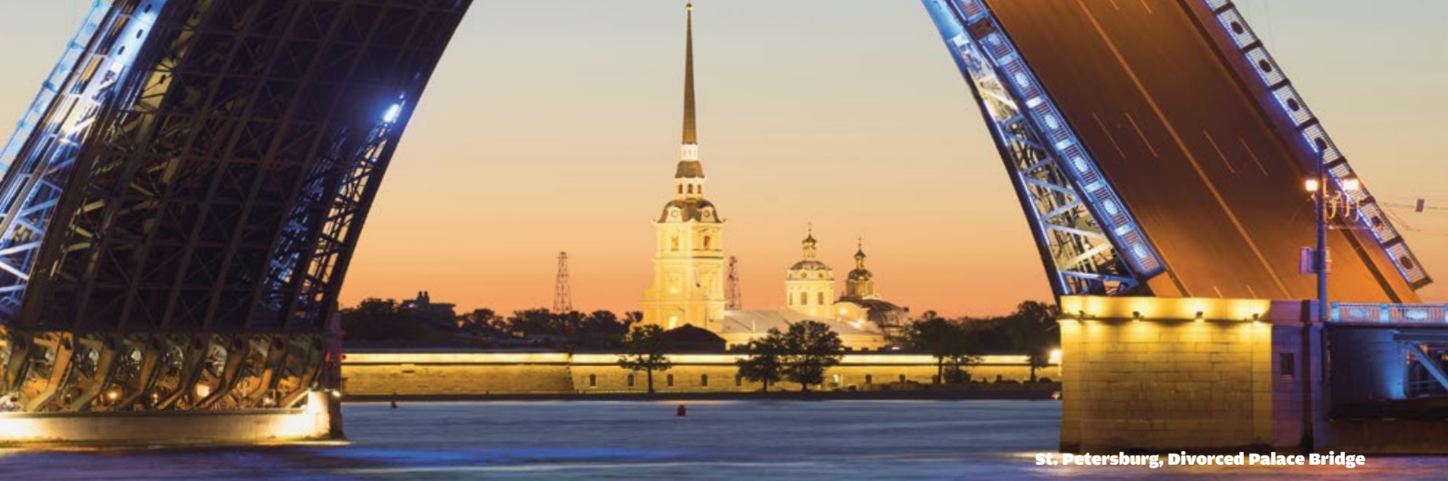
St. Petersburg, Divorced Palace Bridge