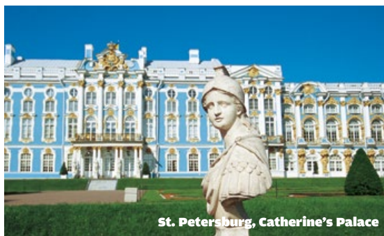
St. Petersburg, Catherine's Palace