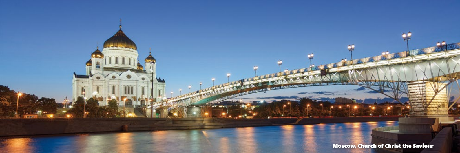
Moscow, Church of Christ the Saviour