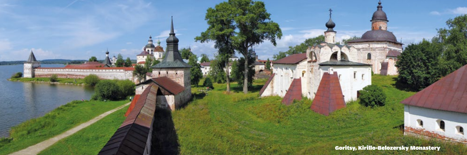
Goritsy, Kirillo-Belozersky Monastery