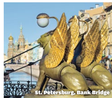
St. Petersburg, Bank Bridge