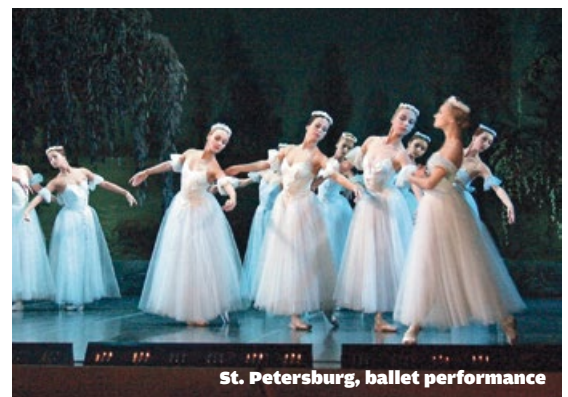
St. Petersburg, ballet performance