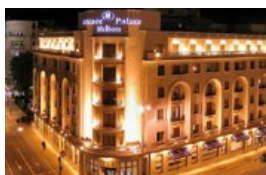
(4) Athenee Palace Hilton ★★★★★

Boutique hotel in historic building. 53 rooms with A/C, Sat-TV, safe, minibar, Wi-Fi, coffee/tea in room. Fine dining restaurant, bistro and bar. Free spa and health club.