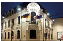
(1) Le Boutique Moxa ★★★★★ 4 Mihail Moxa St.

Boutique hotel with style in classic building near the centre. 53 modern rooms with A/C, Sat-TV, safe, minibar, free Wi-Fi. Breakfast room, garden terrace, sauna.