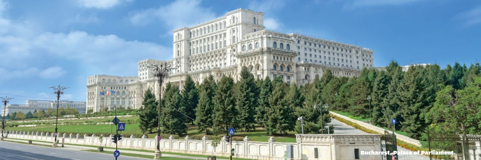
Bucharest, Palace of Parliament