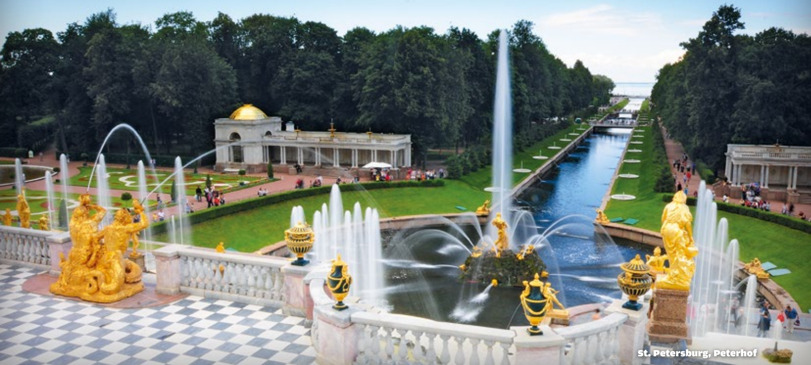
St. Petersburg, Peterhof