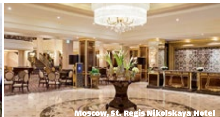
Moscow, St. Regis Nikolskaya Hotel